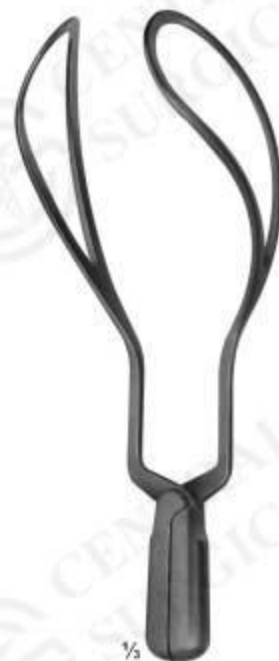
04-6397 WRIGLEY 250 mm