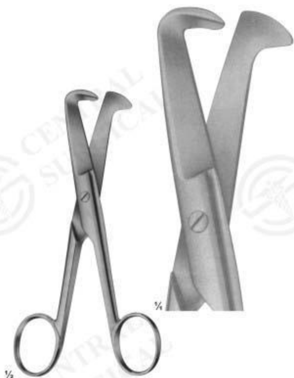
04-6387 SCHUMACHER Umbilical cord scissors 155 mm