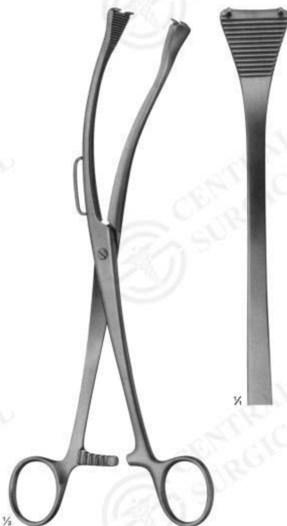
04-6400 GAUSS Scalp Flap forceps 260 mm