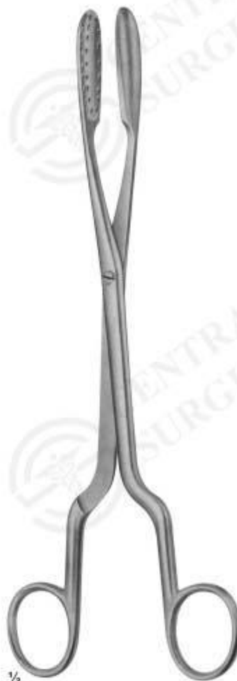
1/2 04-6410 - 04-6411 LEWKOWITZ 245 mm