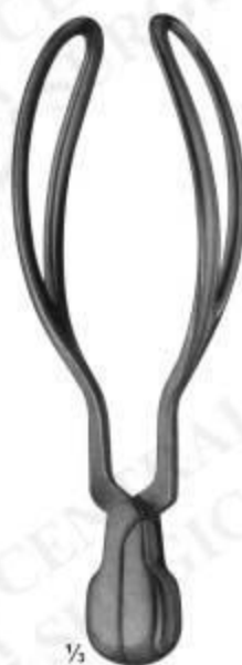
04-6396 SIMPSON 235mm