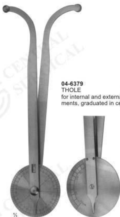
04-6379 THOLE for internal and external measurements, graduated in centimeters