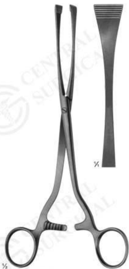
04-6398 GREEN-ARMYTAGE Caesarean section haemostatic forceps, for edges of the transverse incision in the lower segment 220 mm