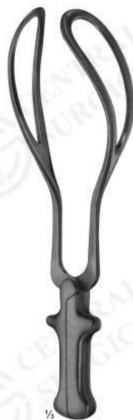
04-6394 SIMPSON-BRAUN 305mm