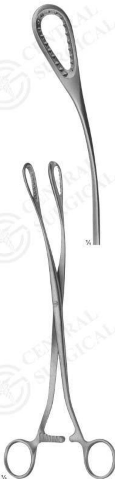
04-6409 SAENGER 265 mm