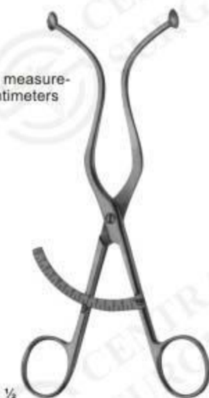
04-6380 DE LEE graduated in centimeters and inches