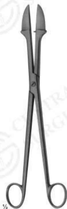
04-6413 SMELLIE Perforator 270mm