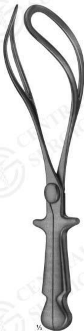
04-6393 NAEGELE 400 mm