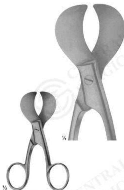
04-6388 Umbilical cord scissors 105 mm