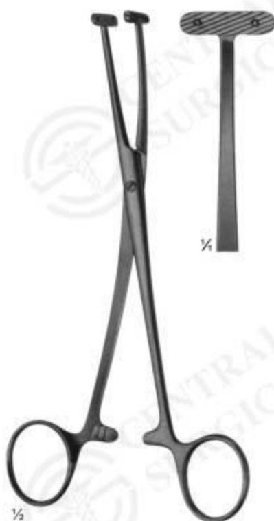
04-6399 WILLET Scalp Flap forceps 185 mm