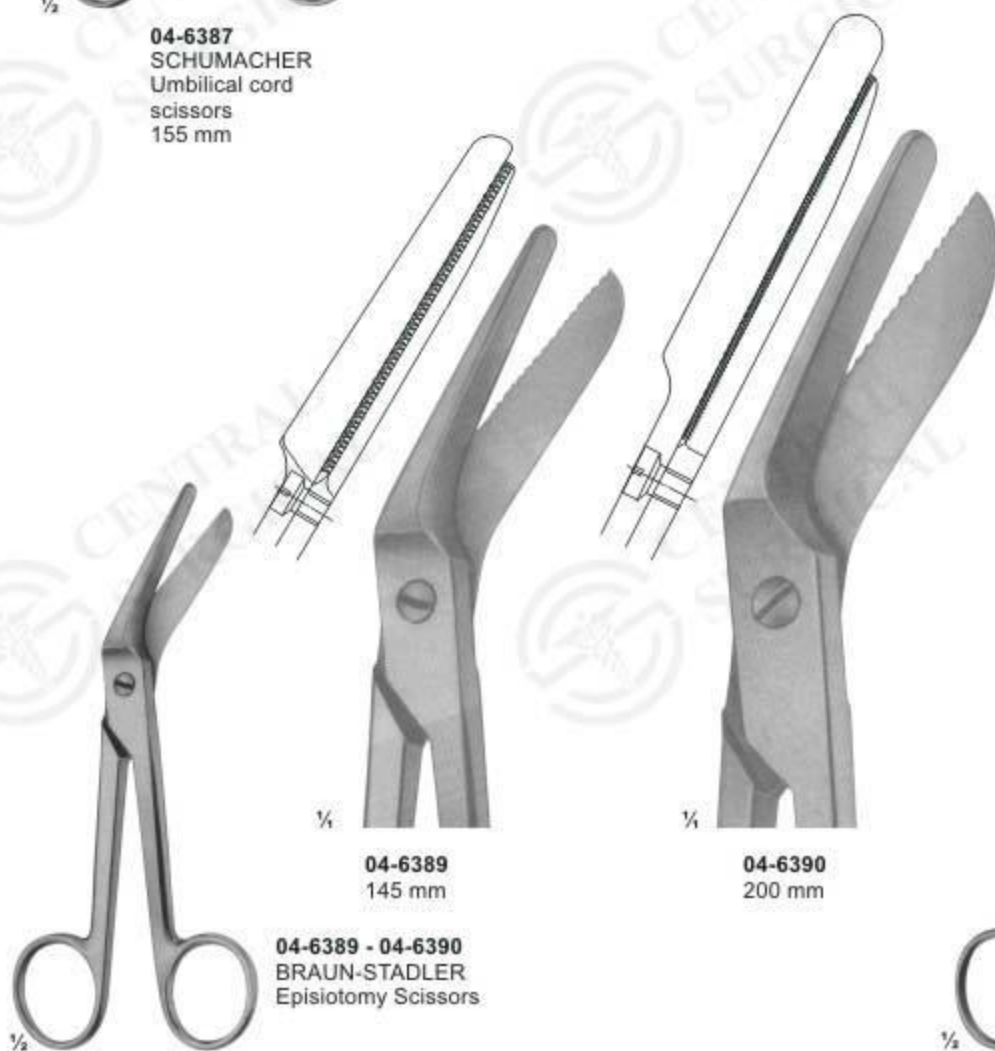
04-6389 145 mm