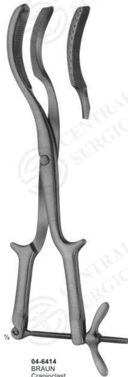
04-6414 BRAUN Cranioclast 420mm