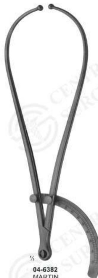
04-6382 MARTIN graduated in centimeters