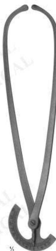
04-6381 COLLIN graduated in centimeters