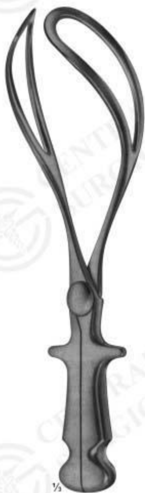
04-6392 NAEGELE 355 mm