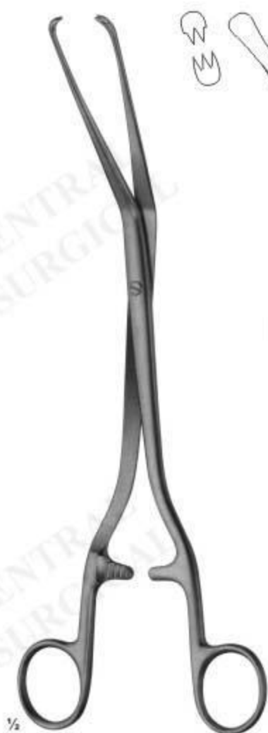
04-6385 HERFF membrane puncturing forceps 255 mm