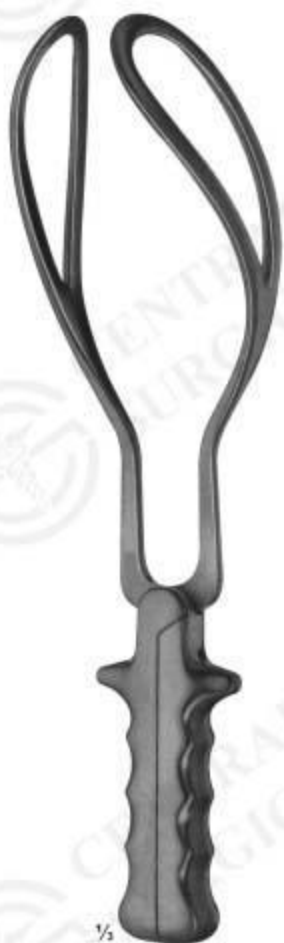
04-6395 SIMPSON-BRAUN 350mm