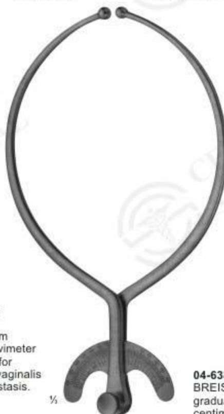
04-6384 BREISKY graduated in centimeters

The additional straight arm can be replaced. The pelvimeter with straight arm is used for localisation of the portio vaginalis uteri and of vaginal metastasis.