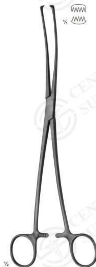
04-6386 IOWA membrane puncturing forceps 260 mm