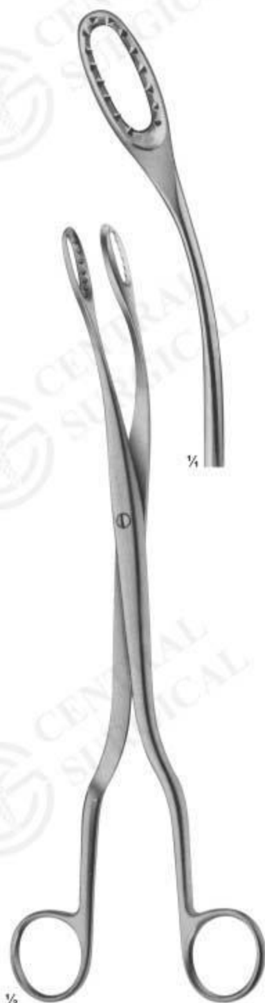
04-6408 SAENGER 285 mm