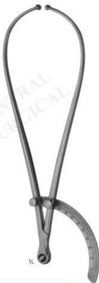
04-6383 SCHNEIDER graduated in centimeters

The additional straight arm can be replaced. The pelvimeter with straight arm is used for localisation of the portio vaginalis uteri and of vaginal metastasis.